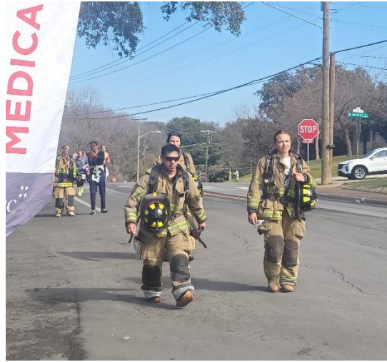
Doing a marathon in full firefighter gear