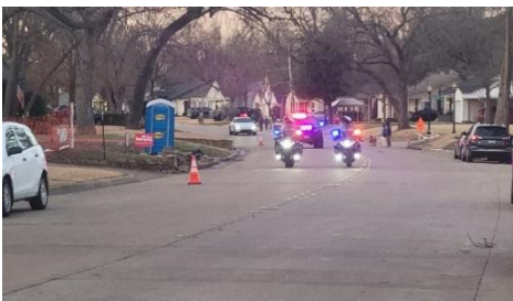
Lead runner on Saturday

Being the Cowtown, naturally, one of the spectators had a cowbell. There were a few cow or cow-ish costumes.