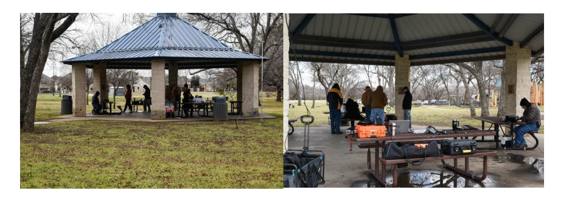
A little cool but still having fun!

In case you didn't get enough last month: